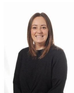
Emotional Literacy Support Assistant