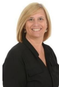
Lead Learning Mentor