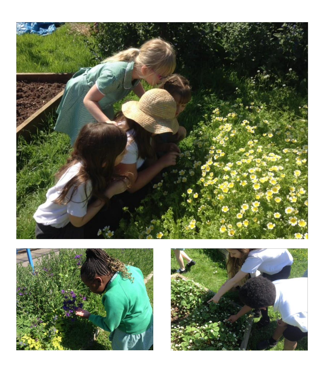
Year 5 visited Mojo Active as part of our Line of Enquiry. We studied and identified different trees, plants and vegetation as well as building on important teamwork skills. We loved each activity and had a lot of fun. Here are just a few pics from the morning.

Year 3 have been outside in the garden looking at all the flowers. We have learnt about the parts of a flower so we examined them carefully. We noticed the flowers on the strawberry plants which we know will become strawberries later in the summer.