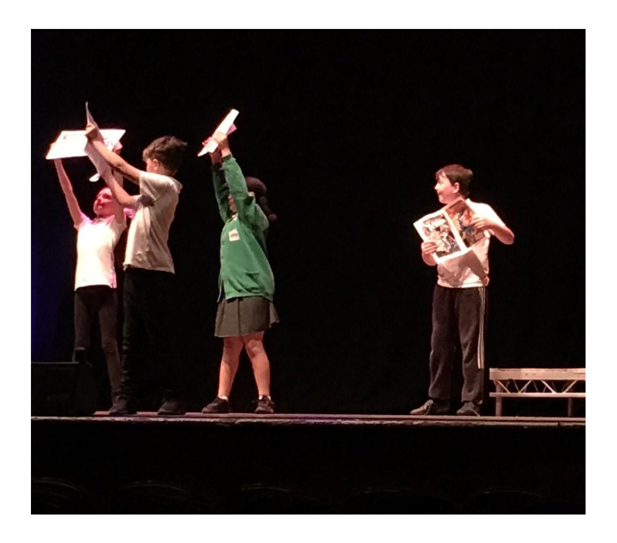
Family Fridays in KS1

All pupils who participated in the event were presented with medals at Celebration Assembly. A big well done to both classes and their teachers for all of the additional work that this entailed.