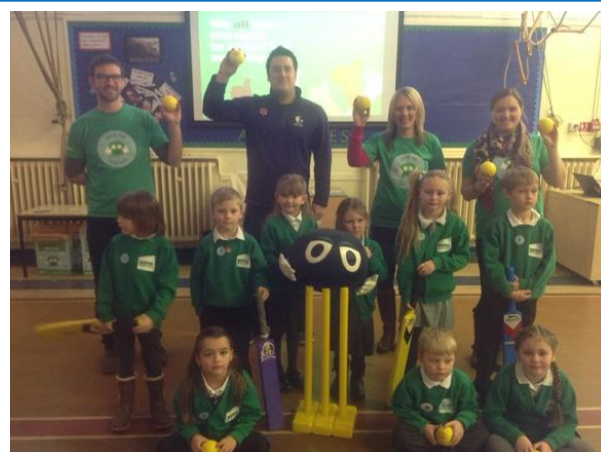
Gloucester Cricket club with some of our KS1 children.

Mon 3 April – Enterprise week, with Enterprise Sale on Friday 7 April